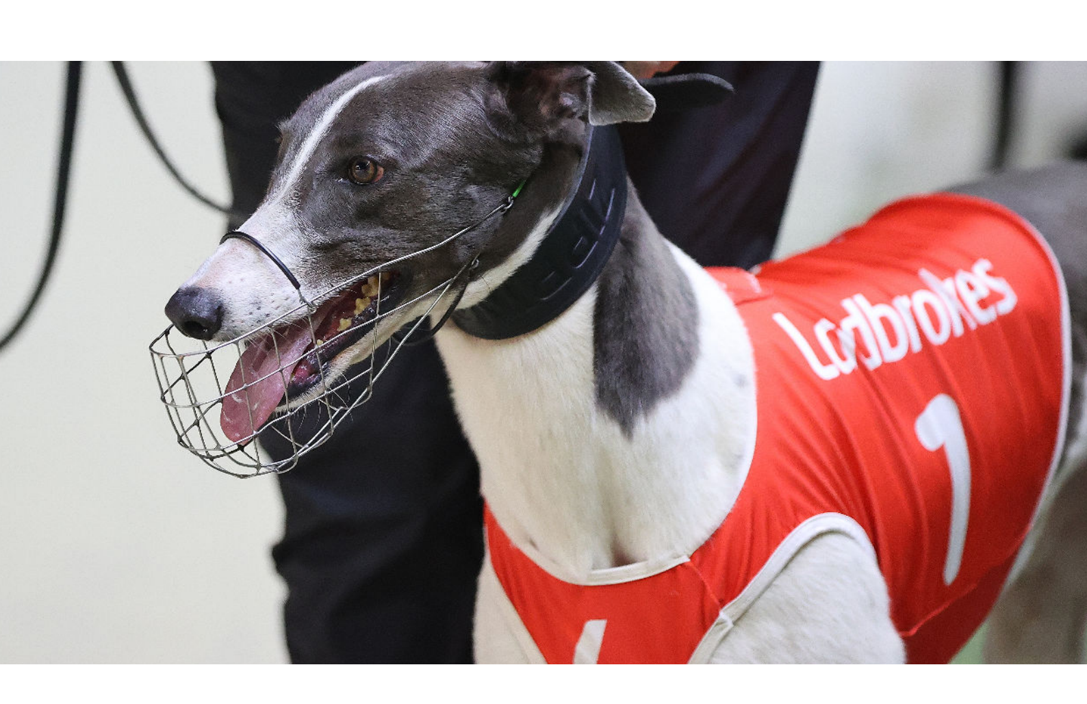
FORMGUIDE AND RACEBOOK