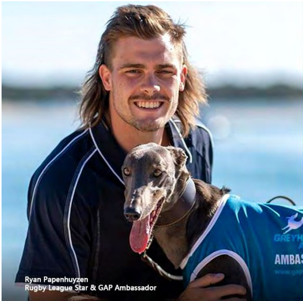
Ryan Papenhuyzen Rugby League Star & GAP Ambassador